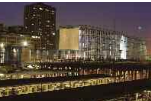
Scopajin-Erige-Acte, champagne et associés-Atelier Marraud Vernheil, Plan-Acte Bourdais

The city, which has undergone a complete transformation recently, has large stocks of land and buildings in reserve at very attractive prices. Commercial property is on average three or four times cheaper than in the Paris region, ranging from 100 to 130 euros per m 2 p.a. (excluding taxes and charges). Residential property is also very competitive with an average price of 171,000 euros for a house in the city centre or an average monthly rent of 7 euros per m 2 .