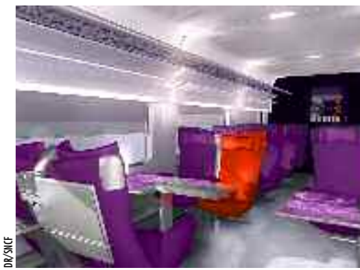
The Paris-Nancy link will be served by a new generation TGV, with an interior design bearing the Christian Lacroix label.

director of economic development at ADUAN, Greater Nancy development agency. It's a feature that investors will no doubt find very attractive. Especially as Nancy already has so much else going for it. • With a potential 24 million consumers and a working population of 10 million within a radius of 200 km, Nancy, France's fifth largest university city, has confirmed over the last few years that it is indeed the "regional economic capital" described by INSEE (national statistics institute)*. * "La Lorraine face à son avenir", INSEE, June 2003.