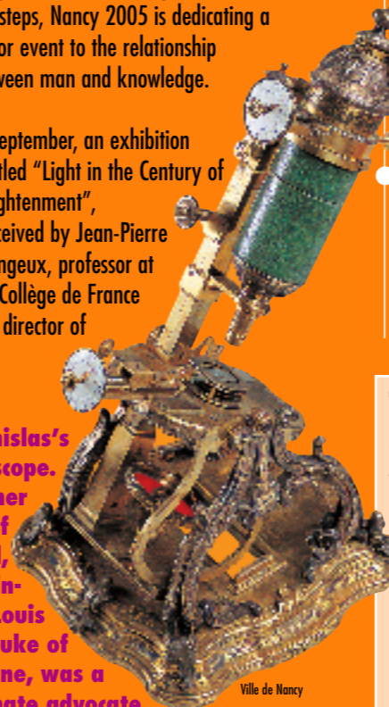
Ville de Nancy

Stanislas's microscope. The former King of Poland, father-in-law of Louis XV and Duke of Lorraine, was a passionate advocate of science and progress.